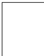
Recent ID Picture